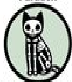
Schrodinger's Time Traveler Paradox