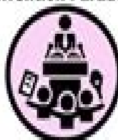
Temporal Democracy Paradox