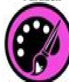
Temporal Artistic Influence Paradox