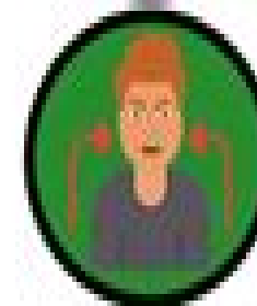
Meeting Yourself Paradox