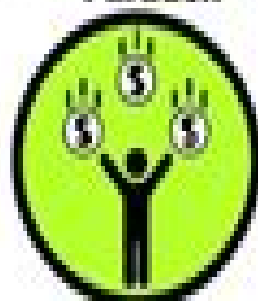
Temporal Lottery Paradox