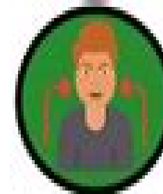
Meeting Yourself Paradox