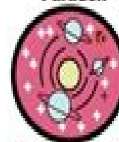
Temporal Species Evolution Paradox