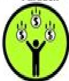
Temporal Lottery Paradox