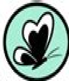
Butterfly Effect Paradox