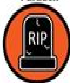
Temporal Afterlife Paradox