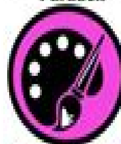
Temporal Artistic Influence Paradox