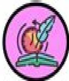
The Bootstrap Paradox