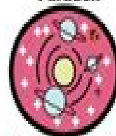
Temporal Species Evolution Paradox