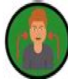
Meeting Yourself Paradox