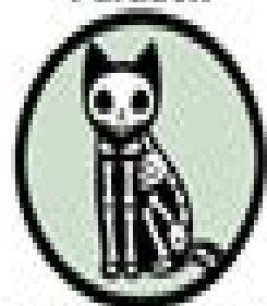
Schrodinger's Time Traveler Paradox