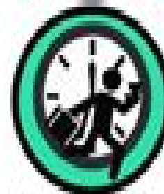
Novikov Self Consistency