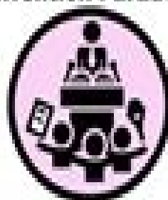
Temporal Democracy Paradox