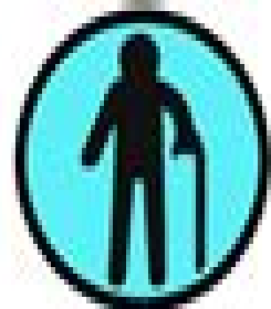
The Grandfather Paradox